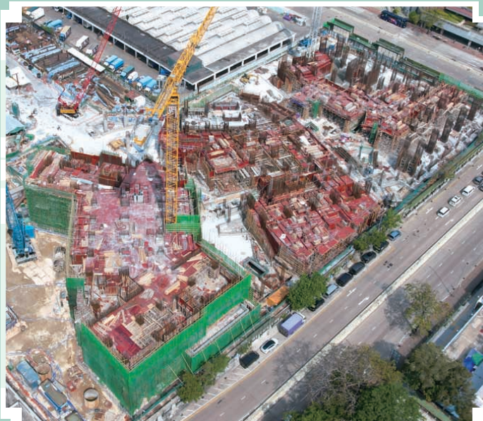
Construction of Public Housing Development at North West Kowloon Reclamation Site 1 (East)