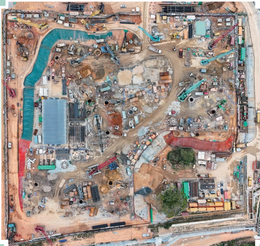
Design and Construction of Public Housing Development at Kwu Tung North Area 19 Phase 2